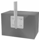
F4 - Face Mount (4 Fixings)*