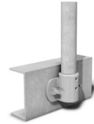
F2 - Face Mount (2 Fixings)