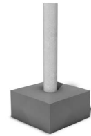
CD - Cored Mount