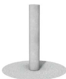
GD - Inground Mount